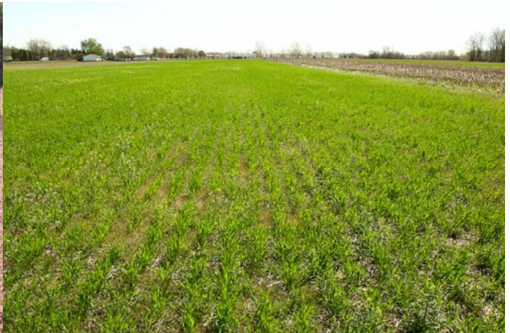
Essex main plot (06/07) wheat and rye growth