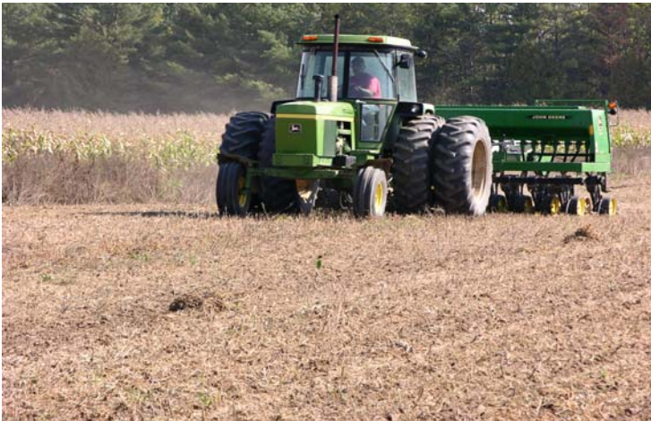
Planting the main Lambton plot—fall 2007

The full results from the 06/07 plot year will be reported at the annual meetings and in the next newsletter.