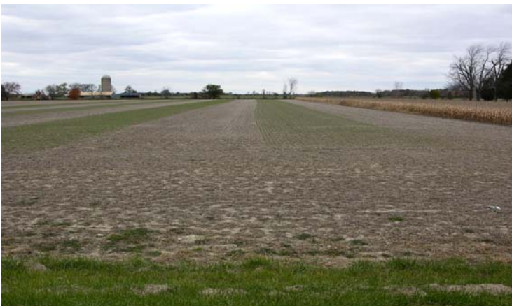
Essex main plot (07/08) growth early November 2007