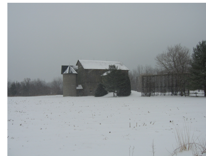
Winter Farm Scene