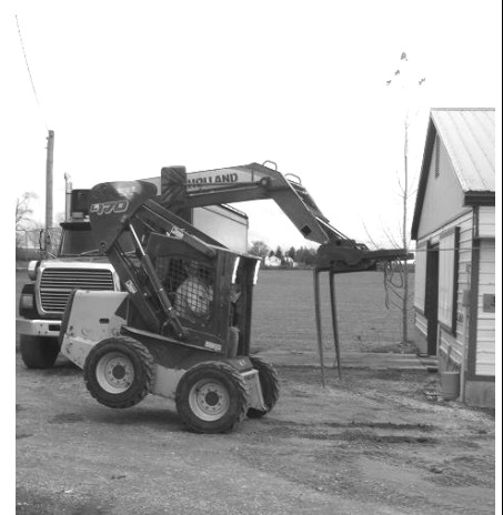
Taking down a feed tank here at home. Yes, those grooves in the ground are from the forks on the skidsteer when it was upended. My camera wasn't quite quick enough to catch that shot! I guess safety doesn't always come first in the GDA (Greater Drumbo Area)

Elgin News http://torscia.wordpress.com/elgin-