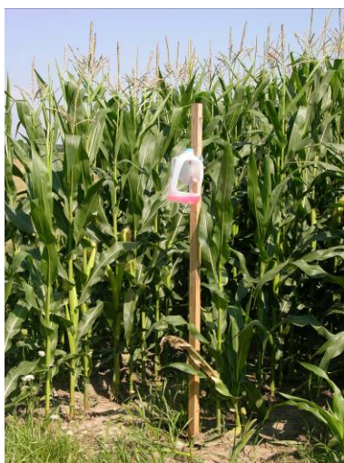
Figure 1. Picture of a western bean cutworm trap at the edge of a corn field.