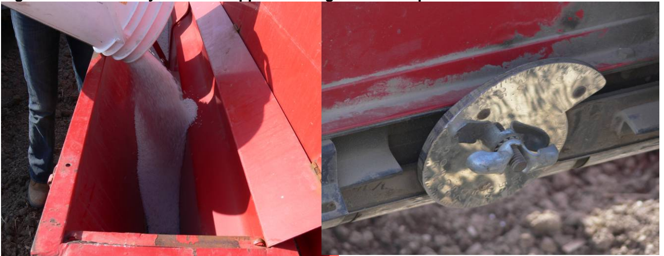
Figure 1: Used Gandy Fertilizer Applicator to get accurate product rates:

At each field location, the equivalent nitrogen rates of ESN Controlled Release Fertilizer and urea were applied at planting. Grower standard nitrogen rate and ½ grower standard rates were applied and replicated twice at each site. The ½ grower standard rates were included to measure any potential residue soil nitrogen effect, which may not show up in the standard grower nitrogen rates. In the 2010 crop year, a blend of Urea:ESN coated urea was applied (see plot data for blend ratio). At harvest, plots were weighed and measured for moisture and test weights. In addition, spring wheat samples were collected and the grain analyzed for protein and quality. The nitrogen products were applied with either a Gandy Fertilizer Applicator (Figure 1) or a field broadcast spreader in strips.