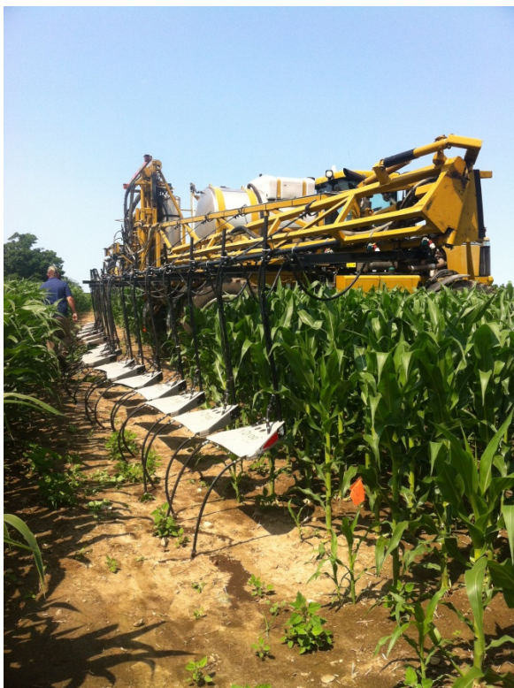
Figure 1. Y-Drop Equipped N Applicator Used in Project

Soil nitrate nitrogen samples were collected from the check (0 lb. N/ac) and 120 lb. N /ac treatment pre-plant prior to side-dressing and 2 weeks following side dressing.